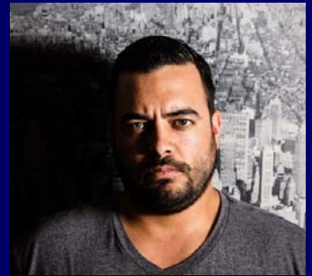
Chad Williams Former U.S. Navy Seal